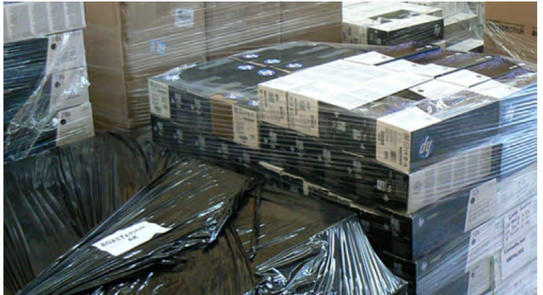
Counterfeit items found in the United Kingdom